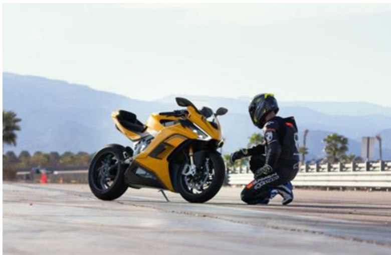
Damon's Award Winning HyperSport Electric Motorcycle

PALO ALTO, Calif., Oct. 23, 2023 /PRNewswire/ -- Inpixon® (NASDAQ:INPX) today announced that it has signed a definitive agreement under which its wholly owned subsidiary, Inpixon Ltd., a division of Inpixon's statistical analytics and visualization for engineering and sciences (SAVES) business based in the United Kingdom ("Inpixon UK"), will be acquired by private Canadian company, Damon Motors Inc. ("Damon"), a British Columbia company, and the maker of the acclaimed HyperSport electric motorcycle (the "Business Combination"). The Damon HyperSport is expected to be one of the safest, smartest, and most powerful motorcycles available in the market. Damon concurrently announced that it has obtained approximately $85 million in pre-production consumer reservations for its motorcycles. The enterprise value of Damon was ascertained by Inpixon's independent financial advisory firm to be within the range of $224 million and $284 million.